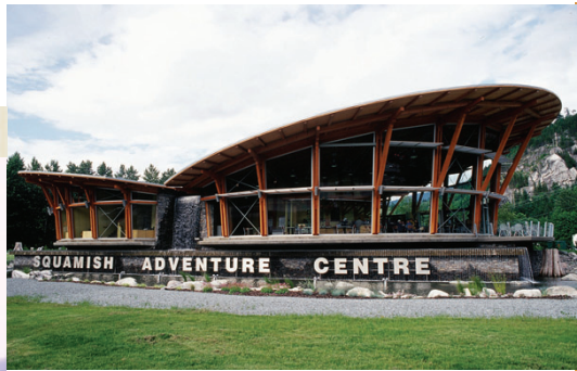
The Squamish Adventure Centre, in the heart of BC's rugged coast mountains is a prime example of BRODA® protection.